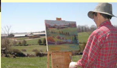
Quality of Life...

Connecticut's dairy farms operate over 65% of our states agricultural landscape !