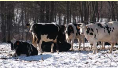
Local Farms & Cows...